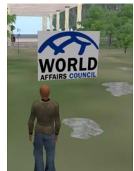
A glance into the virtual world of Skoolaborate.

Opportunities for future development of the “Global Futures” project are enormous, and Global Classroom already has plans to move ahead with this program. The Global Youth Leadership Institute students will be brought into Skoolaborate and GC plans to facilitate discussion with at least one overseas group during the week of the institute. A new group of students from Denny Middle School will also become involved in Skoolaborate , and they may be able to attend an event being put on by students in Los Angeles, who are working on environmental issues and also on studying ancient cultures.