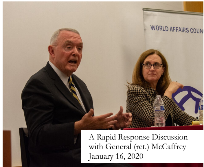
A Rapid Response Discussion with General (ret.) McCaffrey January 16, 2020