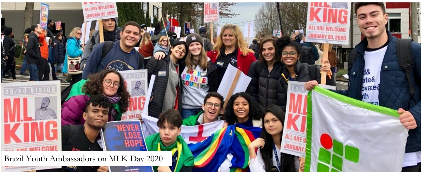
Brazil Youth Ambassadors on MLK Day 2020

XX Hosted Dinners for XX International Visitors