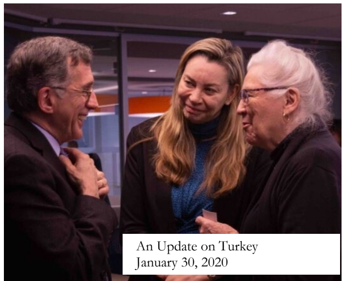
An Update on Turkey January 30, 2020