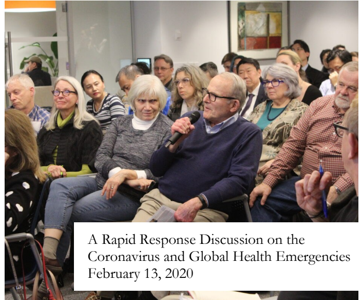
A Rapid Response Discussion on the Coronavirus and Global Health Emergencies February 13, 2020

The Council's events are formatted as discussions, rather than lectures, enabling attendees to engage directly with the speakers and each other. Topics in 2020 included the COVID-19 pandemic, trade, U.S.-China relations, and geopolitics. Events include panel discussions, town-hall meetings, discussion groups, trivia nights, and networking events as well as high-level receptions and private gatherings. No matter the size of the program, participants at every event are able to address their specific interests in a meaningful conversation through moderated Q&A. In keeping with its mission, the World Affairs Council created opportunities for the Seattle community to engage and better understand the many global developments that shaped 2020.